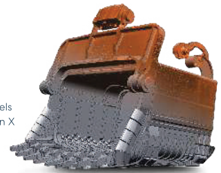
A parametric solid models created in Geomagic Design X

If you can design in CAD, you can start using Geomagic Design X right away. It's fully-renewed user interface and workflow tools make it easier than ever before to quickly and accurately create as-designed and as-built 3D CAD and model data.