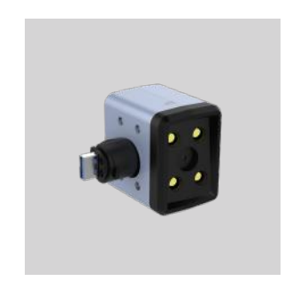
Color Pack (For EinScan Pro 2X) Gets the full-color texture with geometry.