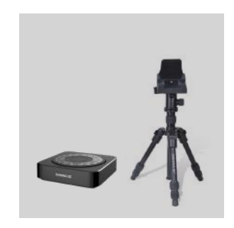
Industrial Pack (For EinScan Pro 2X) Makes a static automatic scan on a tripod possible for a better accuracy.