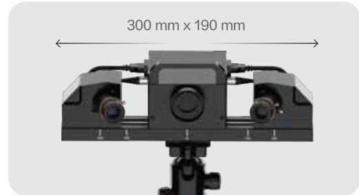
Outer Larger Field of View for scanning medium large objects